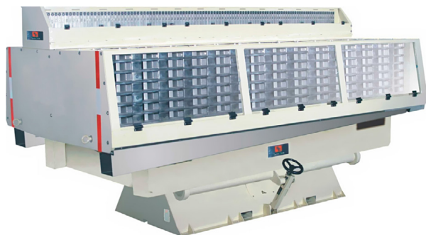
Table separator for additional separation of cleaned material

The SB table separates grain, rice, etc. by specific gravity, which have already been separated by thickness and length. Unlike other systems, the SB table is also capable of separating materials with the same gravity, but with different bouncing effect.